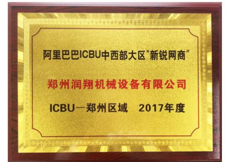
Top 1 Alibaba Supplier